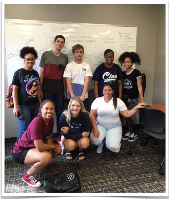
Promise Scholars at the Explore Your Library Challenge.

People of PROMIG: What profession other than your own would you like to attempt?