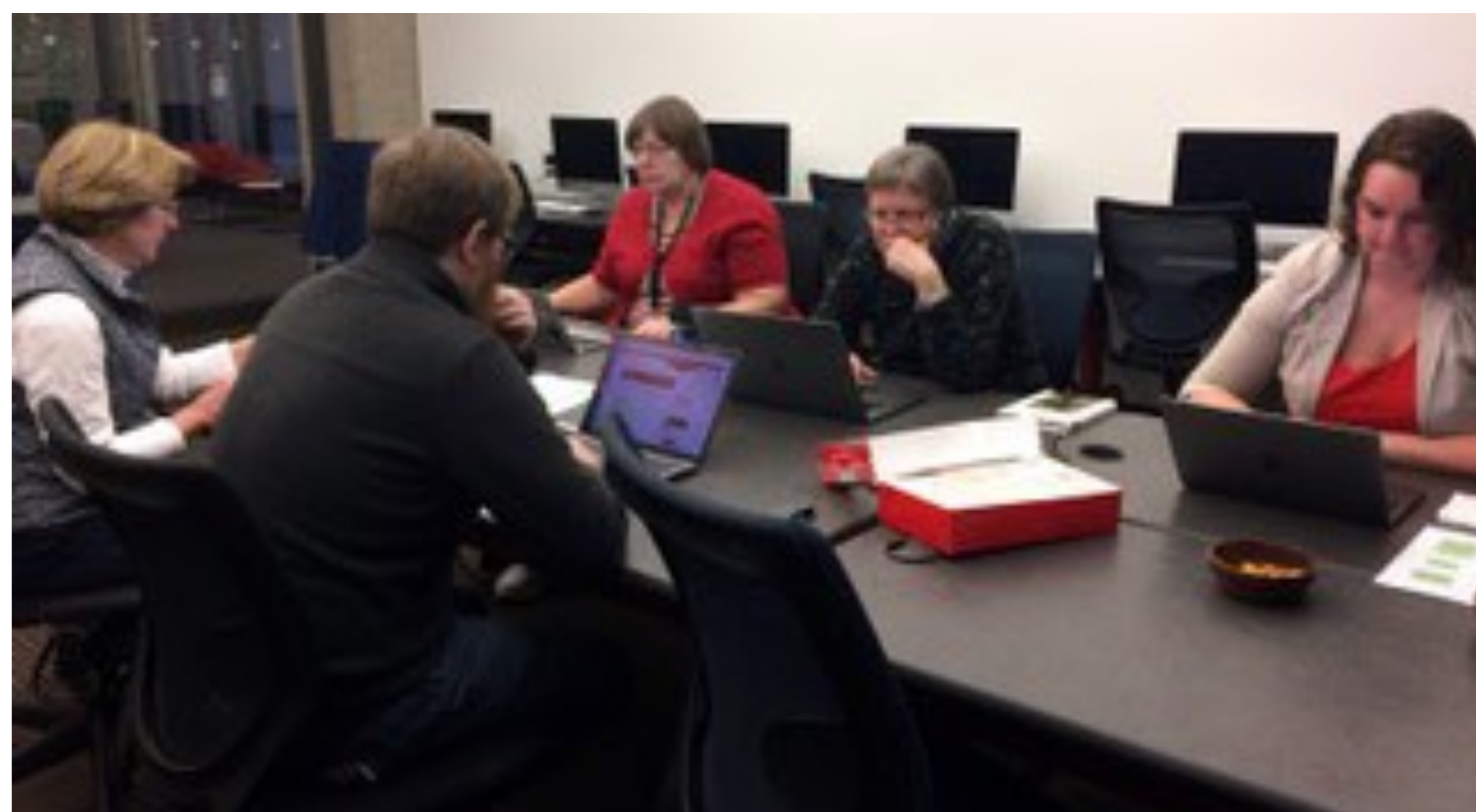
Library staff at Oberlin during the 2018 #1Lib1Ref campaign