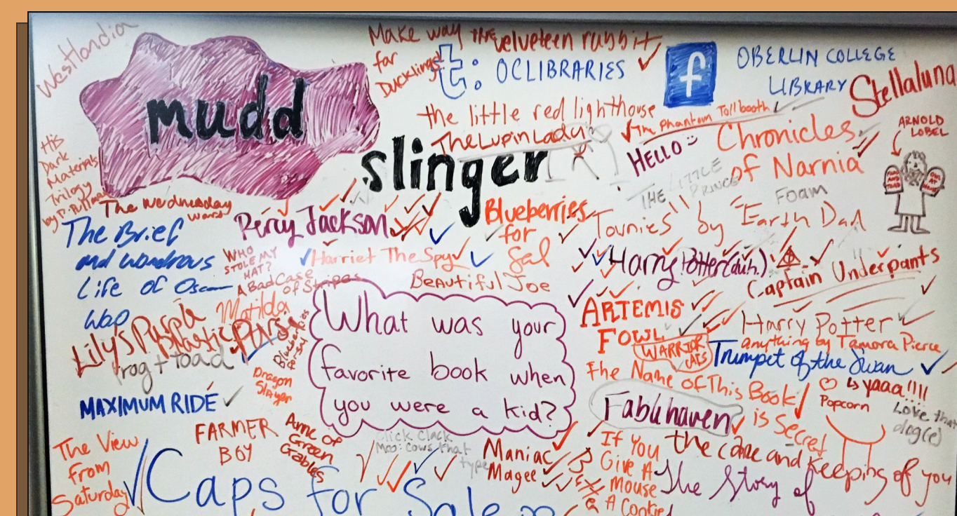
What was your favorite book when you were a kid?