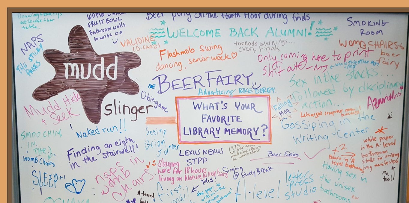
What's your favorite library memory?