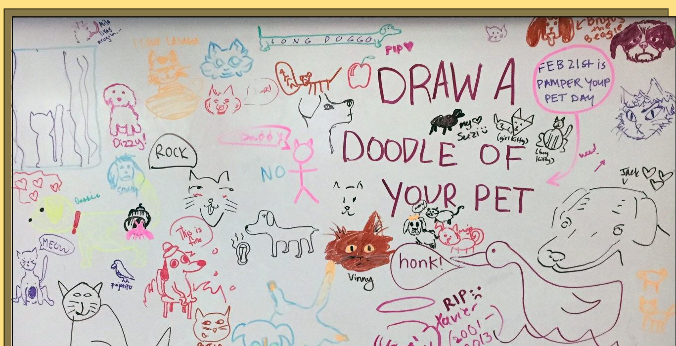
Draw a doodle of your pet.