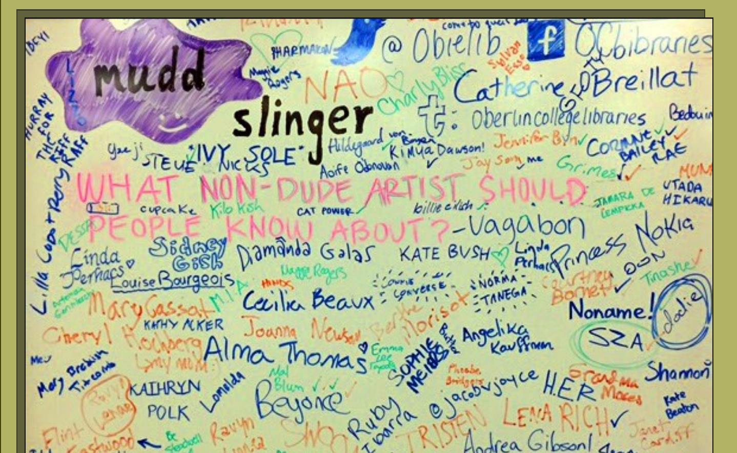
What non-dude artist should people know about?