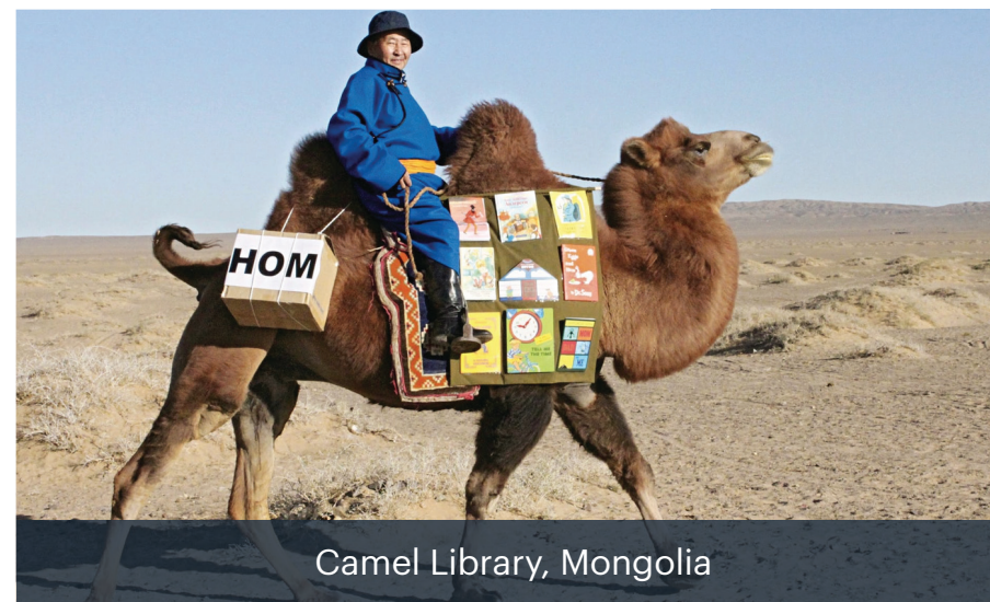
Camel Library, Mongolia