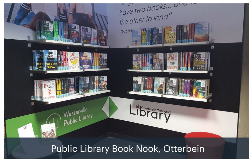
Public Library Book Nook, Otterbein