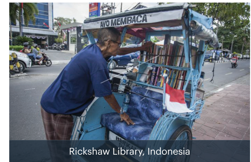
Rickshaw Library, Indonesia