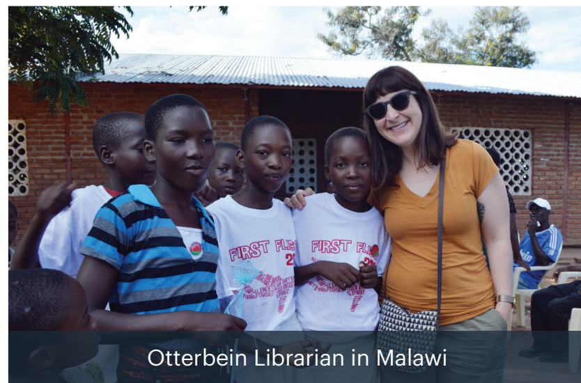
Otterbein Librarian in Malawi