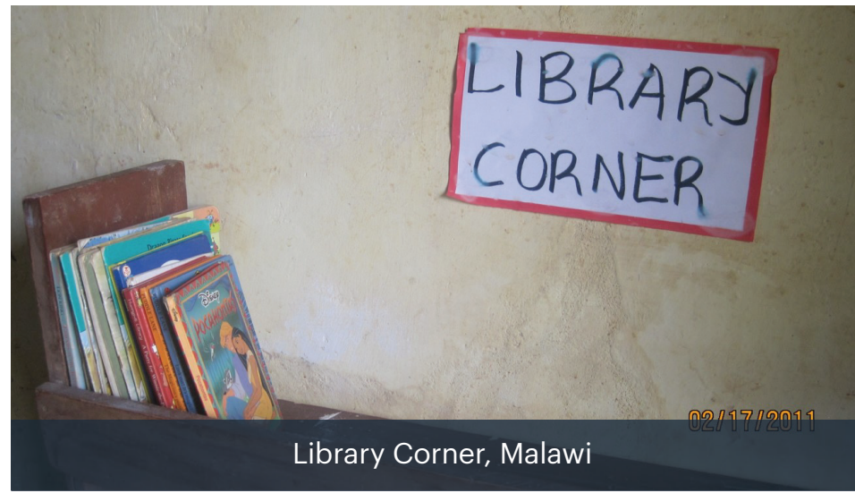
Library Corner, Malawi