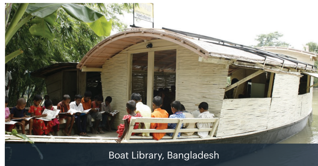
Boat Library, Bangladesh